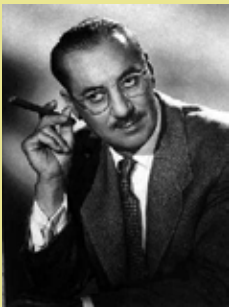
Groucho Marx The King of Sarcasm

If you want to turn hours into minutes, renew your enthusiasm.